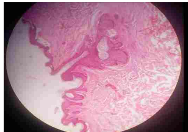
Figure 4. Histological section revealed, Invaginated papillary projections filled with laminated keratin plugs.

there were multiple comedones, closely arranged sinus with minimal discharge were present. Face, head and neck region, extremities, including hands, feet and nails, as well as mucous membranes were spared. Family history and routine laboratory studies were unremarkable. Histopathological finding were suggestive of nevus comedonicus (Figure 4).