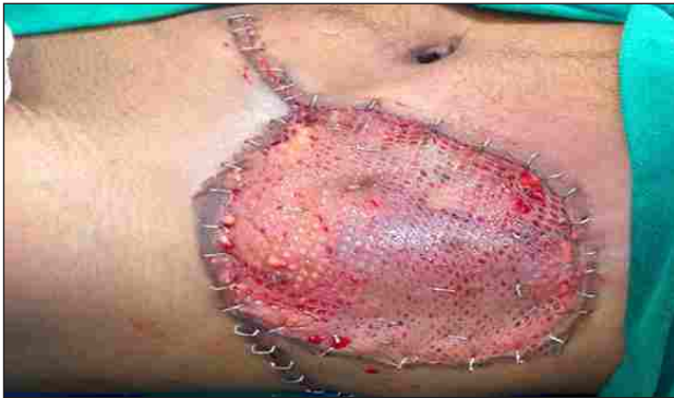
Figure 2. Intraoperative picture showing split thickness skin grafting done after excision of lesion.