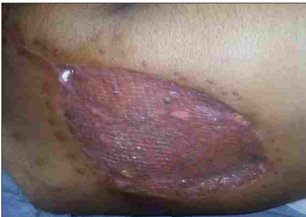
Figure 3. post operative wound showing graft take, on followup after 2 weeks.

There was history of multiple sinus discharge from last two years. He had taken oral and topical antibiotic creams applied multiple times but couldn't get relief. He had also taken a nine month course of anti tuberculous drugs advised by some local doctor. There was no associated skeletal and neurological abnormality. He denies any history of trauma or irritation. He was non smoker with negative family history.