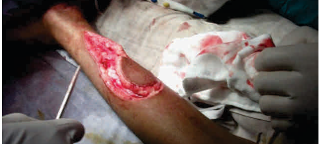
Picture 2 C: The flap has been elevated to include the lesser saphenous vein and the sural nerve.