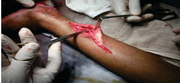
Picture 2 B: A 0.5 to 1 cm width of fascia containing these structures composes the" pedicle".