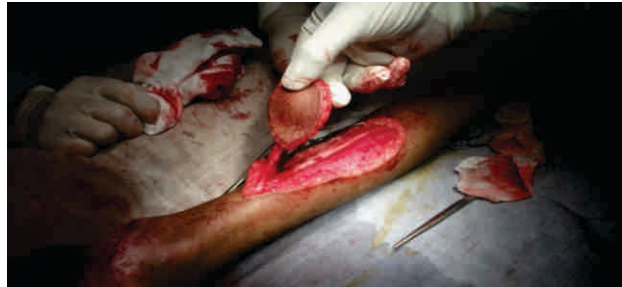
Picture 2 D: The flap has been elevated to include the lesser saphenous vein and the sural nerve.