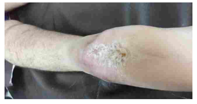
Picture 1 A: Unstable chronic scar tissue on the calcaneous, patient using crutches for walking.

The author preference for flap pedicle by developing a 0.5 - 1 cm wide strip of subcutaneous fat and fascia that harbors the sural nerve and lesser saphenous vein. The flap and pedicle may then be separated from the underlying muscle and paratenon layers. The arc of rotation is 180 degree providing coverage to the heel defect (Pic 1 H). This flap may also provide coverage to the posterior heel-Achille, anterior ankle and dorsum of foot. The donor site may be closed primarily if it is small or with a split-thickness skin graft if it is larger (Pic 1 I, Pic 2 G).