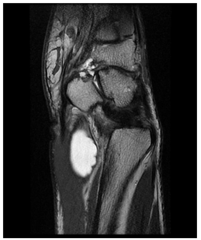
Figure 2. T2-weighted magnetic resonance image of patient's ganglion within Guyon's canal

Nerve conduction studies showed a distal ulnar nerve lesion only causing denervation of the small muscles of the left hand, and excluded peripheral neuropathy.