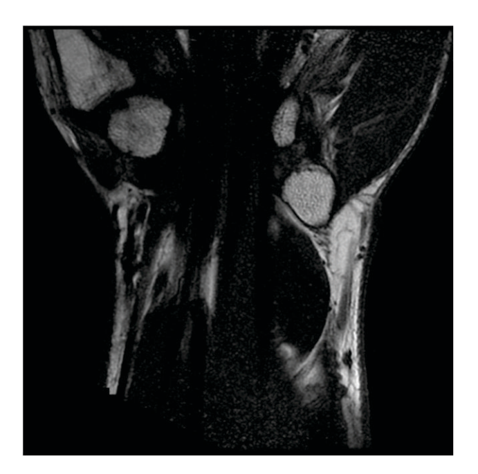
Figure 1. T1-weighted magnetic resonance image of patient's ganglion within Guyon's canal