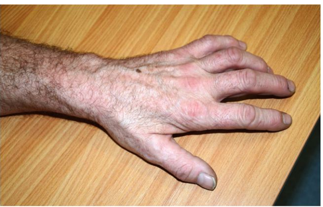
Figure 10. Intrinsic muscle atrophy of left hand at 3-month follow-up

However there was no evidence of ganglion recurrence.