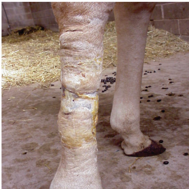
Figure 6: Twelve months post-operative view of the healed fasciocutaneous flap over the giraffe's fully functional and weight bearing right hind limb.

Despite these practices, the wound became infected superficially with a mixed bacterial population, including a multi-resistant Pseudomonas (sensitive to gentamicin), which led to partial wound breakdown. Systemic antibiotics were stopped as it was suspected that they were contributing to development of resistance rather than effectively controlling infection. Copious wound lavage and regular sterile dressing changes were used to manage the superficial wound infection for a total of 10 weeks resulting in healing. Nine months after surgery, minor trauma to the wound required medical management using dressings as before and antibiotics for 7 weeks. 18 months later the giraffe was re-homed to another zoo. The animal was able to ambulate normally throughout this period (Figure 6).