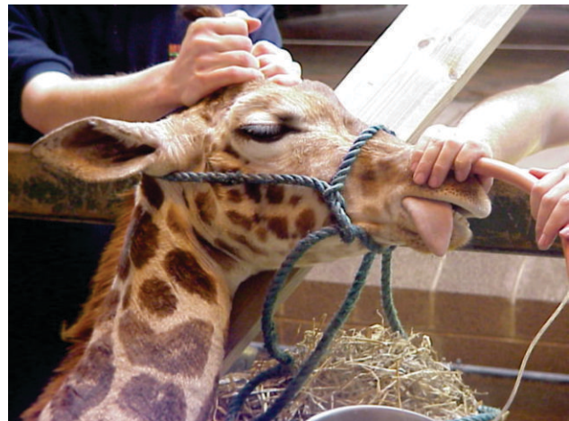
Figure 3: The intubation tube consisting of a long rubber pipe inserted intranasally.

using oxygen and isoflurane (Isoflurane-Vet, Merial Animal Health, Ltd) via a 12mm on a large animal Steven's anaesthetic machine using a circle circuit. (Figure 3)