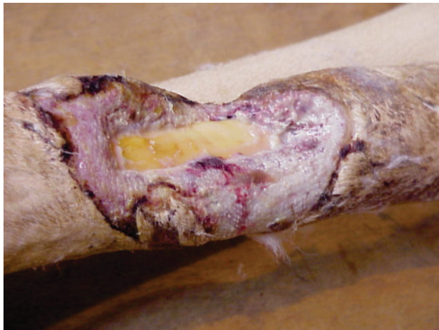
Figure 1: Preoperative photograph of the soft tissue defect before debridement. The exudate overlying the granulation tissue and necrotic wound edges were debrided and the bony cortex minimally burred to expose healthy bleeding bone.

wound management was attempted using amoxicillin (Betamox LA, Norbrook UK) and wound dressings. The wound dressings were comprised of hydrogel (IntraSite gel, Smith & Nephew) or petrolatum-impregnated gauze pads (Jelonet, Smith & Nephew), polyester-covered absorptive cotton sheets (Melolin, Smith & Nephew) and/or cotton wool, lightweight conforming bandage (K-band, Urgo) and bandaging tape (3M™ Vetrap™ Bandaging Tape). Bacterial culture and sensitivity testing revealed a resistant Proteus species and therefore antibiotic was changed to enrofloxacin (Baytril Max, Bayer UK). After several weeks, there was still no evidence of healing and the soft tissue defect with bony exposure had almost doubled in size (Figure 1)