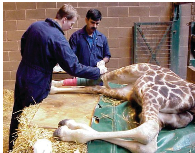
Figure 2: The makeshift operating table made of bales of hay in the giraffe's enclosure.

A general anaesthetic of 9mg sublingual medetomidine (Zalopine 10mg/ml, Orion Pharma, Finland) and 150 mg ketamine (Vetalar-V 100 mg/ml, Pfizer Ltd) was administered by hand injection and then surgical anaesthesia was maintained with the giraffe in left lateral recumbent position, on a makeshift surgical table made of bales of hay (Figure 2)