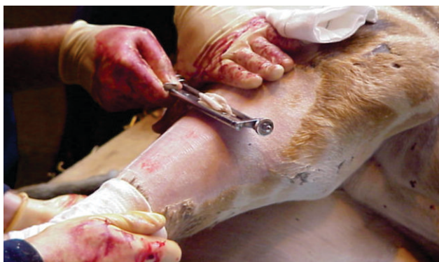
Figure 5: Harvesting the split thickness skin graft with a Humber knife after shaving the ipsilateral lateral thigh

The donor defect was resurfaced using a split thickness skin graft, taken with a Humby skin graft knife (Downs Surgical, Sheffield, UK), from the ipsilateral thigh (Figure 5).